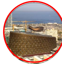
Mar campus: health and life sciences