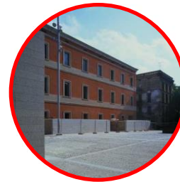
Ciutadella campus: social sciences and humanities